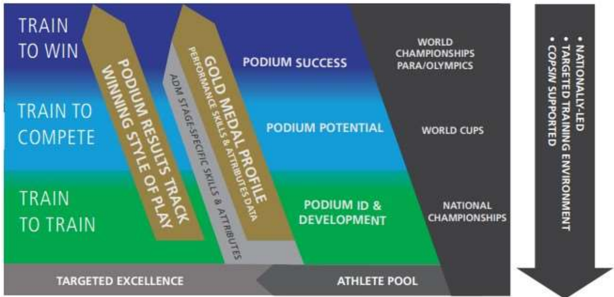
Figure 1 – Podium Pathway (LTAD 3.0)

Canadian Sport Institute / PacificSport athlete and coach support for the Canadian Development and Provincial Development nomination focuses on athletes and teams 5-12 years from the international podium, identified by the sport-specific Podium Pathway (Figure 1) and Gold Medal Profile. These athletes and teams represent both the next generation (5-8 years away) and future generations (9-12 years away) of Olympic and Paralympic or World Championship medallists.